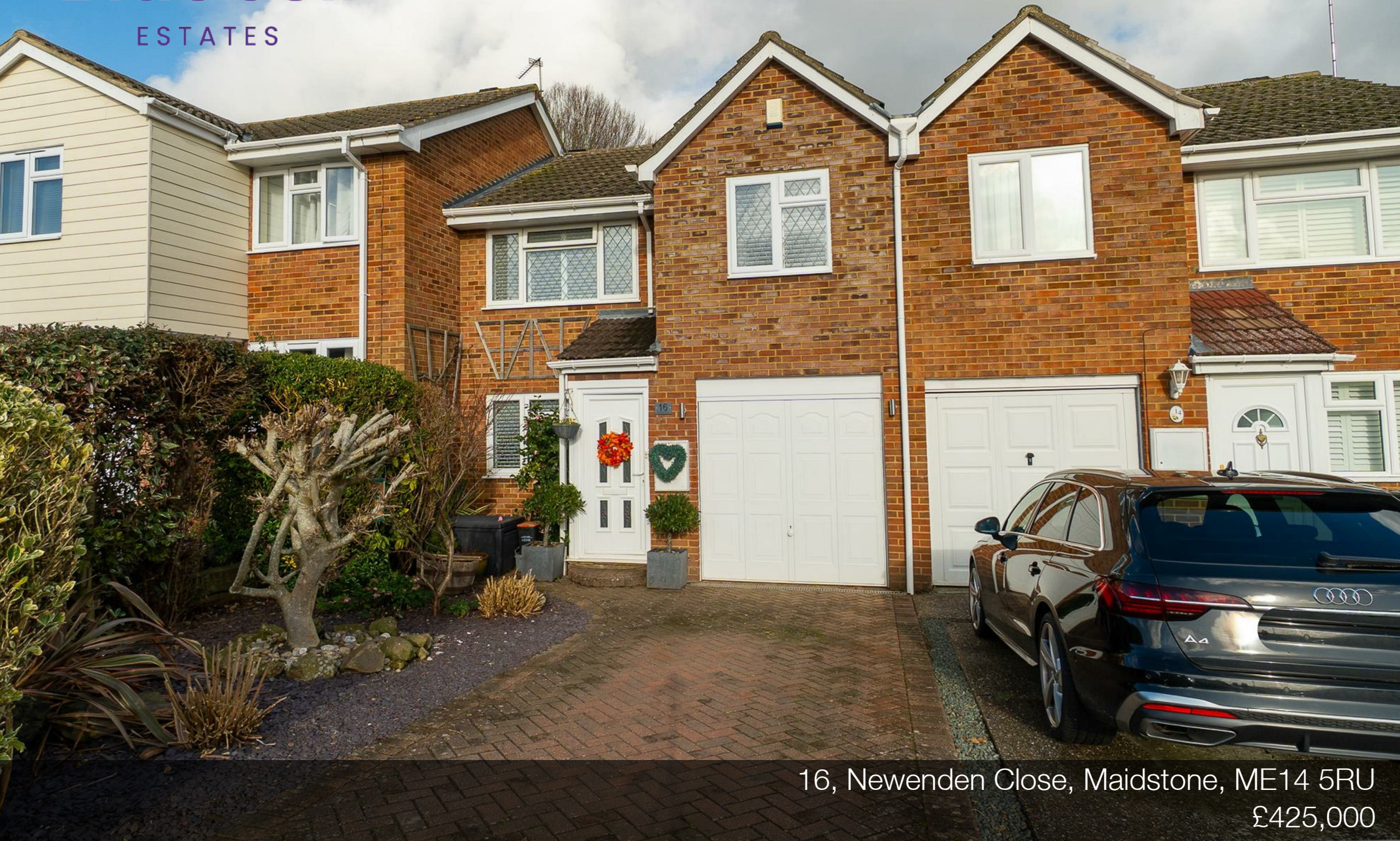
16, Newenden Close, Maidstone, ME14 5RU £425,000